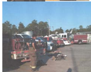
At the Incident Staging area, firefighters catch a moment of rest where ever they can before going on to there next assignment.

The IFOC has been talking about a way of letting all of our members know what we have been doing, and what IFOC Chaplains are doing out in the field.